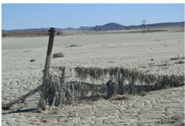
The silt makes the once fertile field look like a desolate lunar landscape.