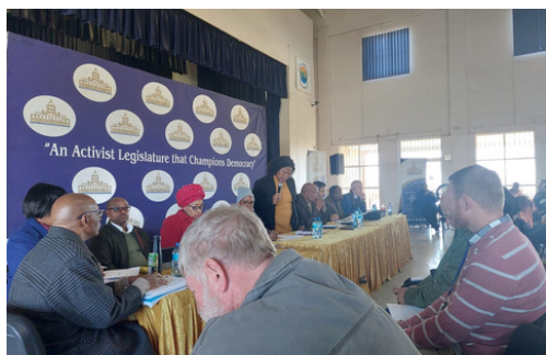
The public hearing in Bethlehem on May 24.