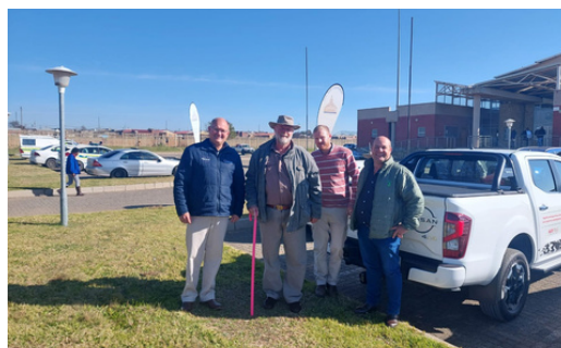
The team of Free State Agriculture during the Bethlehem public hearing.